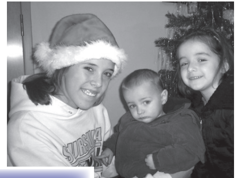
One student helped two neighborhood children make Christmas gifts for their parents at the Angel Toy Program.