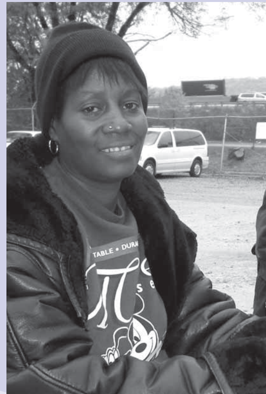
Receiving food or gifts brightened the holidays for over 6,000