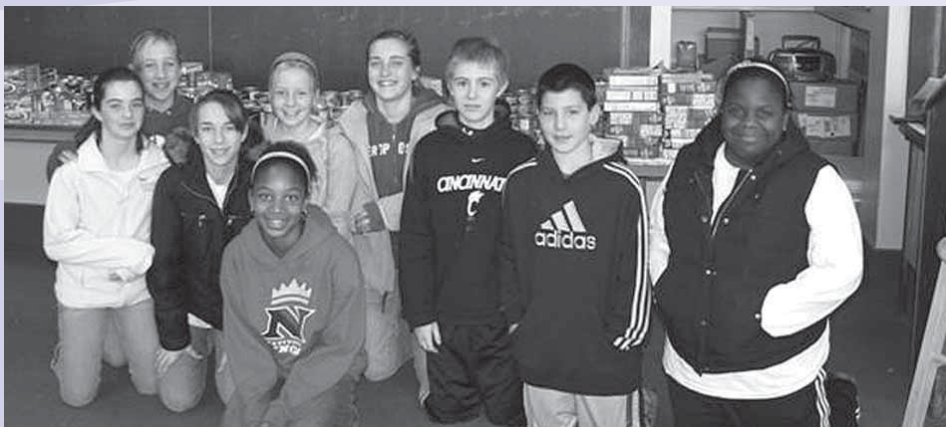
Students collected food just in time for the holidays.