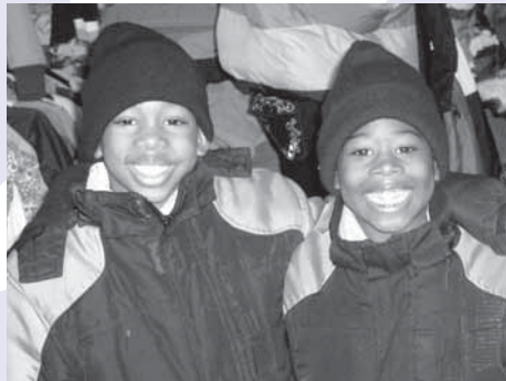
These brothers excitedly picked out matching warm winter coats.