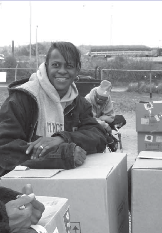
families this year.