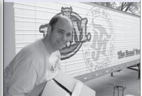
Volunteers worked hard to box up hundreds of meals. Crossroads Community Church donated food, and JTM helped store and transport it.