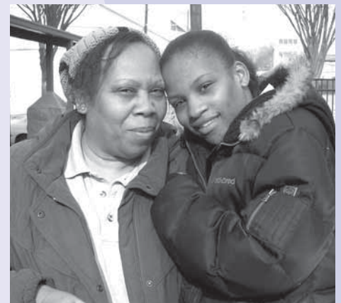
This family received food and a renewed Christmas spirit during a hardship.