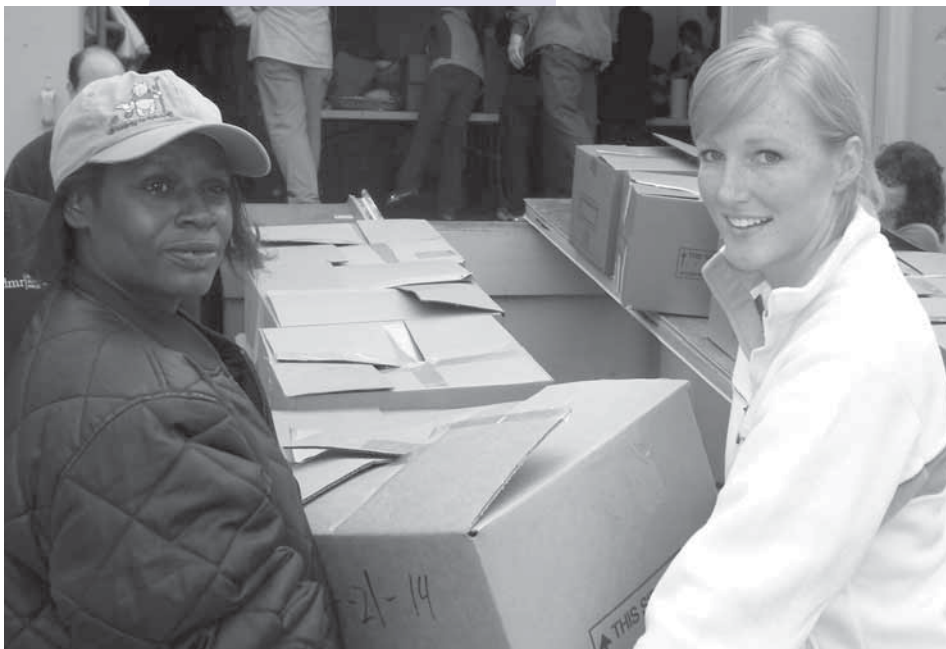
Over 500 turkey dinners brought hope to many families on Thanksgiving.