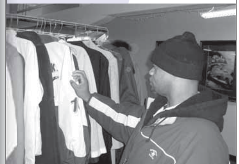
After browsing through many racks of coats, this gentleman found warm coats for everyone in his family.