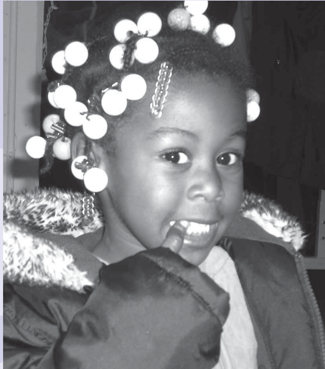
A little girl found a warm coat in her favorite color with a fancy fur trim.