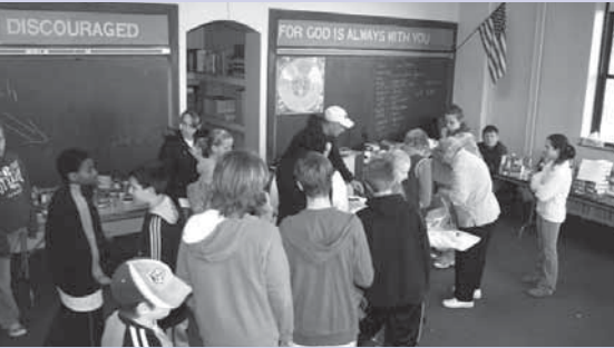
Students at Nativity organized a canned food drive for the holidays.