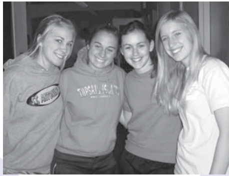
Student volunteers spend Saturday mornings giving back to their community.