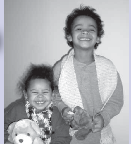
Brother and sister played with new Christmas toys while a social worker helped their mother with basic necessities.