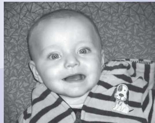
A mother and her infant son found relief in their struggle through prayer and assistance from a social worker.