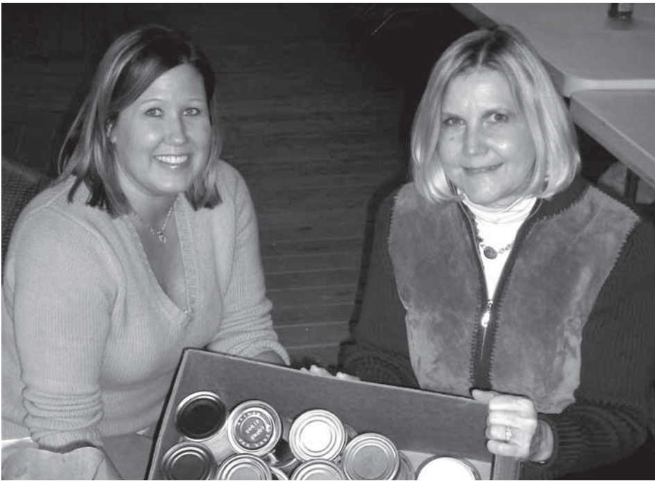
With the help of friendly, workplace competition, employees at Harte-Hanks collected hundreds of pounds of food to help those in need.